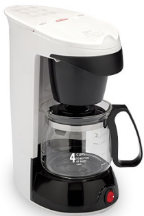
J25037 COFFEE MAKER SUNBEAM 3226 WHITE 4-CUP AUTO OFF 4/CS 1 4+ $29.65 $28.65