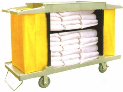
102015 CART MAID GREY/BLK PANELS 10-12 ROOM 40 X 58 X 22 PRICED TO SELL - ORDER TODAY $259.00