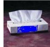
D28101 FACIAL TISSUE 100/BX 30/CS 2PLY 1CS 10+CS $15.10 $13.10